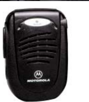
Remote Speaker Microphone Plus with Bluetooth™ Wireless Technology and Remote Speaker Microphone Kit.