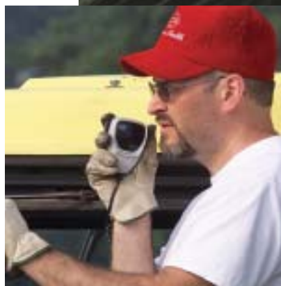
Heavy-Duty Microphone is larger, providing easier use for glove wearers.