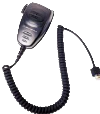
Standard Compact Microphone provides basic Push-to-Talk functionality.