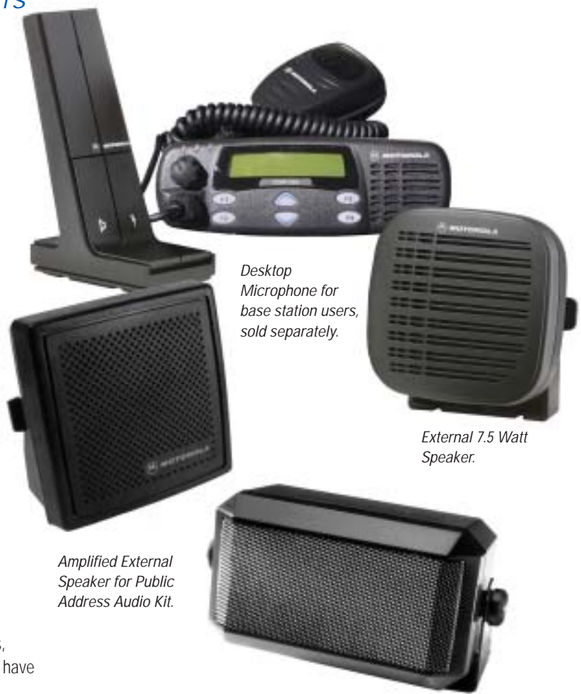
Desktop Microphone for base station users, sold separately.

GLN7326A Desktop Tray with Speaker Ideal for securing mobile in place in a desktop environment. Includes speaker for increased volume when receiving calls in high-noise areas.