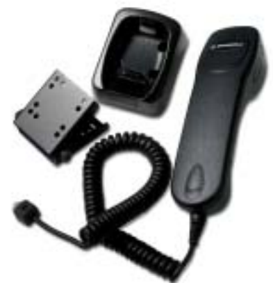
Telephone-Style Handset includes cup and hardware.