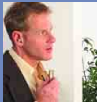
RLN5317A – Beige Two-Wire Comfort Earpiece with Combined Microphone and PTT