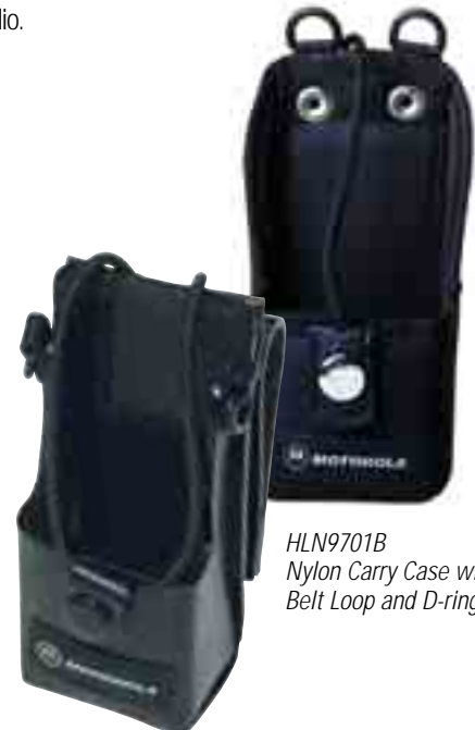
HLN9701B Nylon Carry Case with Belt Loop and D-rings