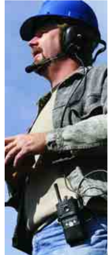
RLN5641A Hard Leather Carry Case with 2.5-Inch Belt Loop

Attaches to D-rings on carry cases to provide added comfort.