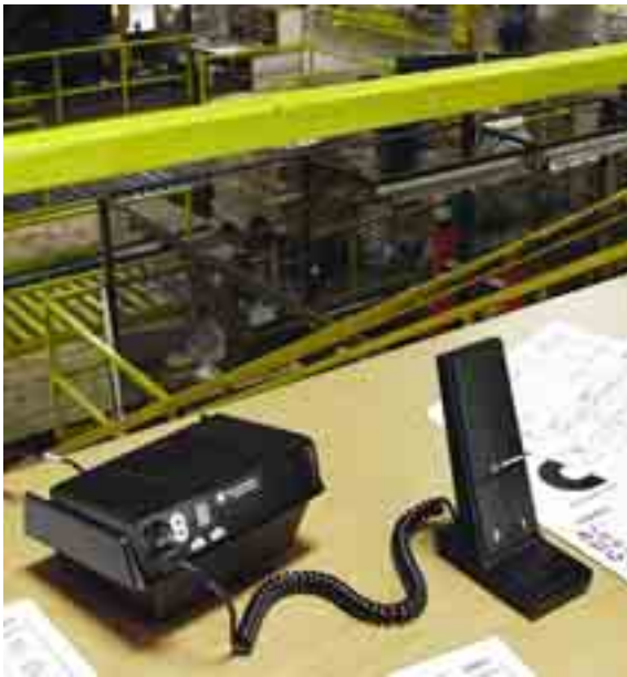
The PM400 is compatible with most Motorola portable and mobile radio accessories.